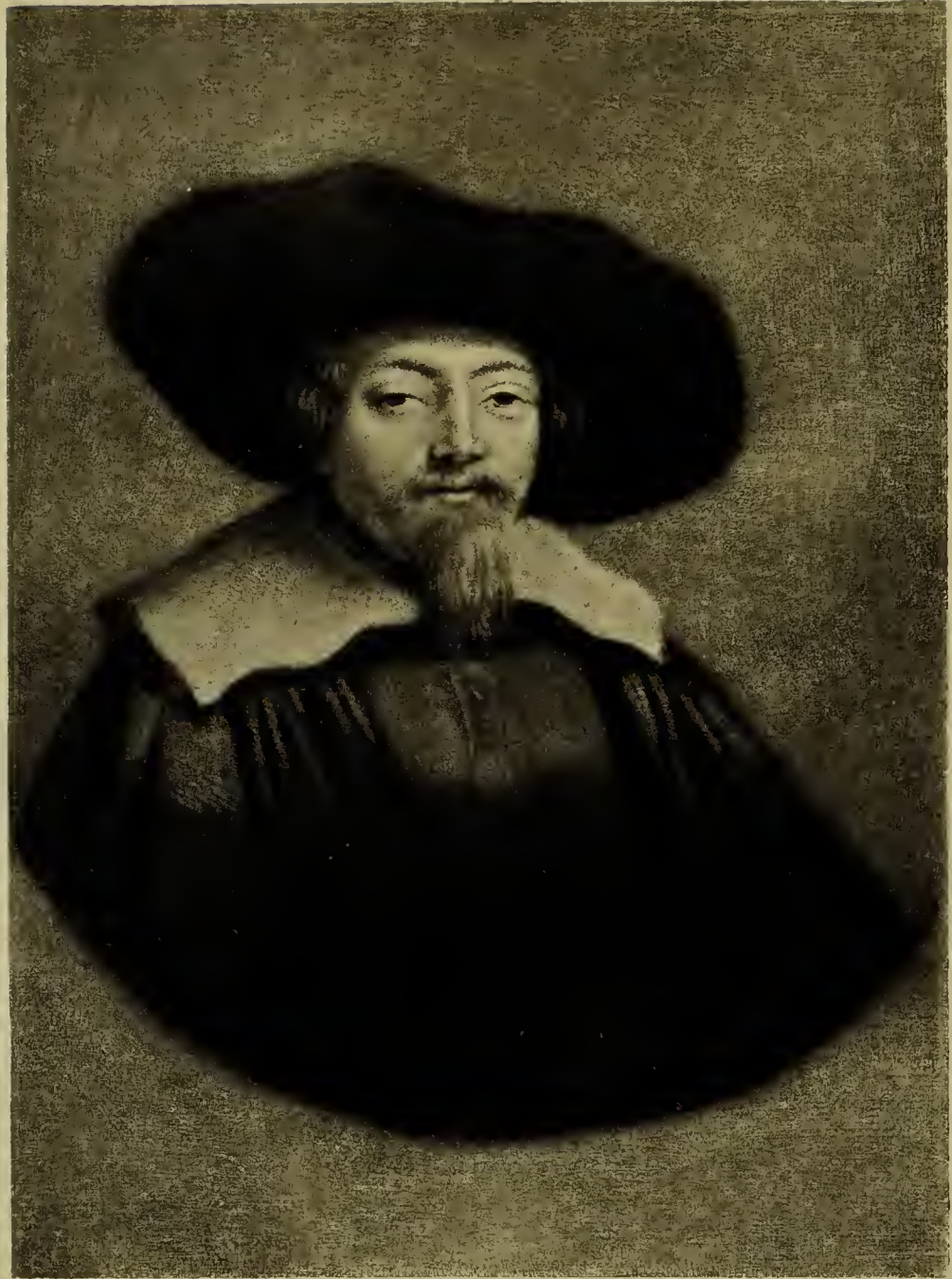
Menasseh ben Israel. from an Etching by Rembrandt.